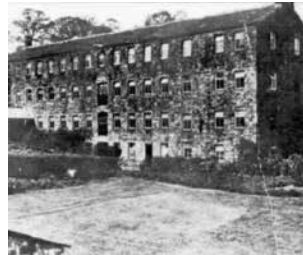
Former Goitstock Mill