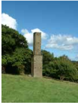
Goitstock Mill Chimney